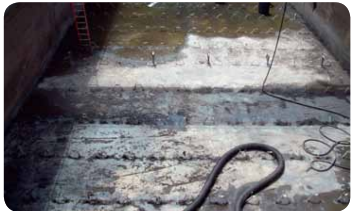
The refurbishing of Aeration Basin #6 is almost complete