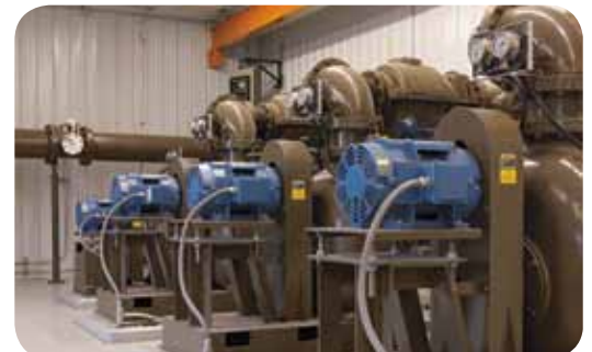
Pump #1 RAS Pumps