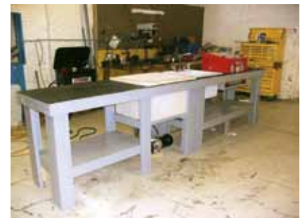
Meter Cleaning Table

The Fabrication Team here in Waycross is finishing up with the meter cleaning and rebuilding station, and is preparing to put it in service. This will save thousands of dollars a year in new meter