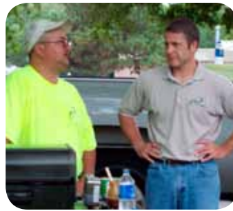
ESG/Warner Robins Associates recently enjoyed a cookout in appreciation and recognition of their hard work and perseverance.