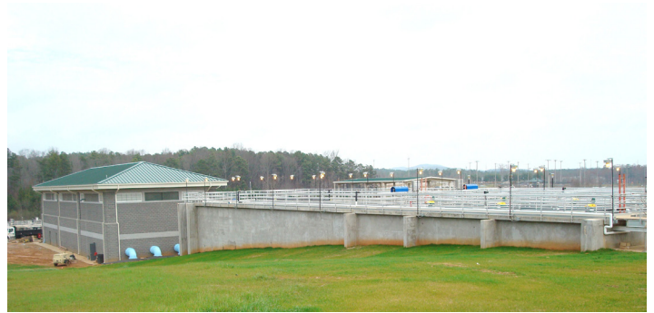
12 MGD Plant Expansion • Forsyth County