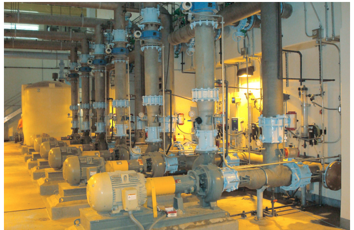
Membrane Building Pump Room