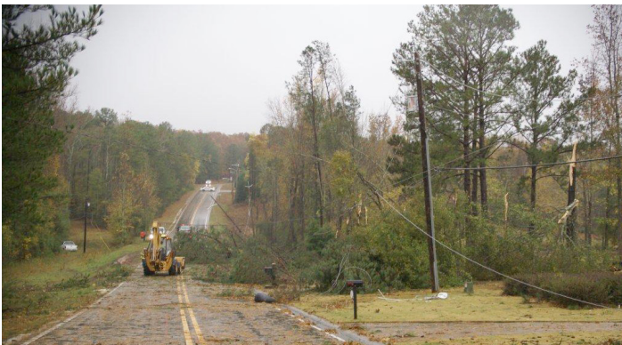
In November, a tornado swept through Opelika. The damage was fairly extensive in some areas with one of our newest lift stations being severely damaged. Team Opelika crews worked tirelessly to help clear streets and restore power to affected communities.