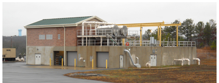
Forsyth County's James Creek WWTTP