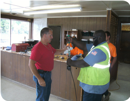
Natural Gas Training