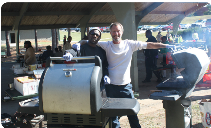
Rockdale's "Rivers Alive" Clean Up Event • October 2011

The Quigg Branch Belt Press was recently refurbished in-house by the ESG/Rockdale Team and completed three weeks ahead of schedule, saving Rockdale County Water Resources $13,750. Over $25,000 of parts were replaced during the refurbishment. Everyone at Quigg played an important part in “keeping operations running smoothly” while this project was underway. Also, major aerator bearing replacement at the Quigg Wastewater Plant utilized new overhead lift equipment. ESG/Rockdale is also proud to announce that they have qualified for Gold Awards for all five Rockdale County facilities.