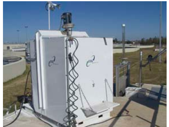
New Polymer and Lime Pumping System