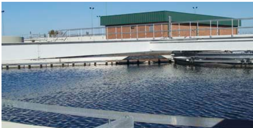
Tupelo Clarifier #1