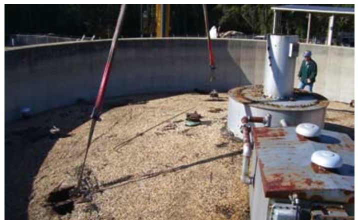
Digester Lid Removal in Perry, Georgia. The careful attention to safety and meticulous planning enabled the ESG/Perry Team to remove this 50-foot diameter digester lid which weighed approximately 85,800 pounds without incident!

Employee safety is one of ESG’s core values.